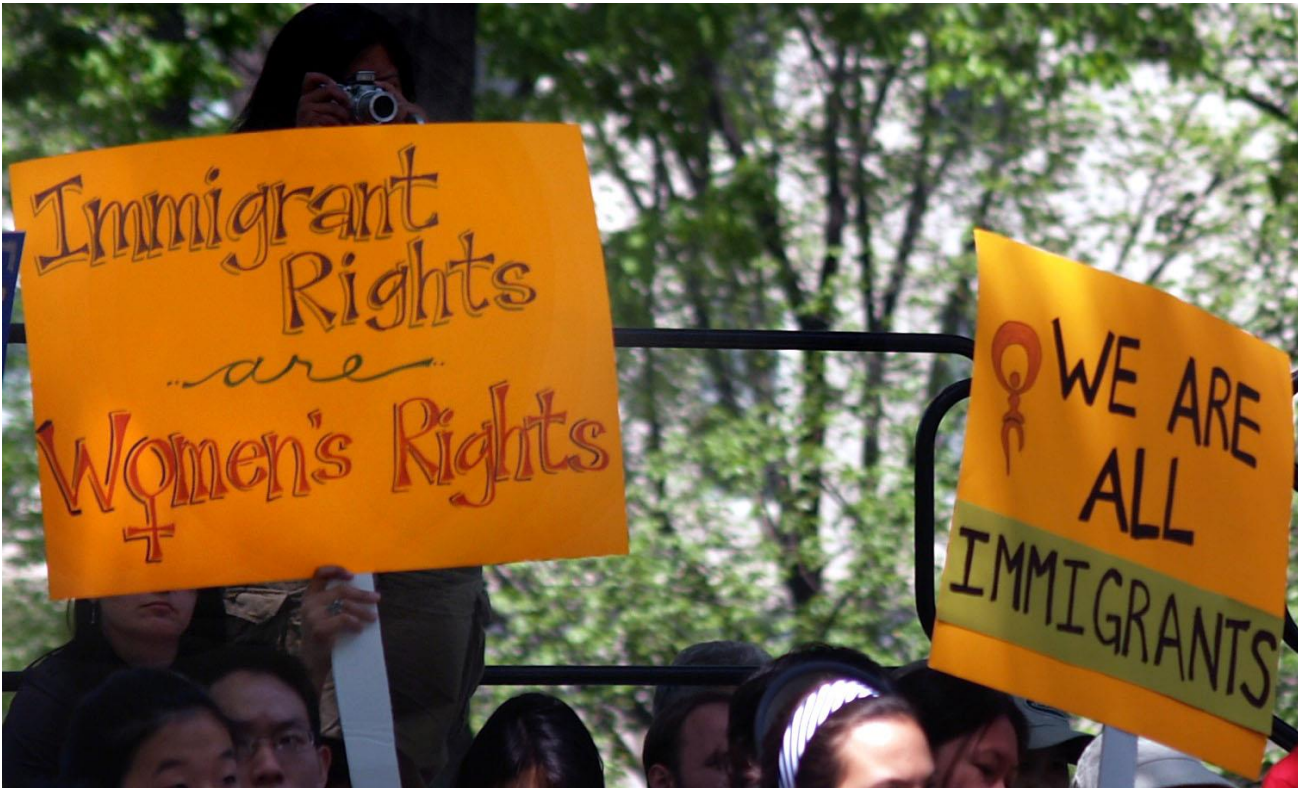
Signs At The May Day Immigration Rights Rally.