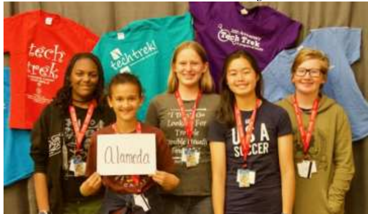
Alameda Branch Tech Trek 2018