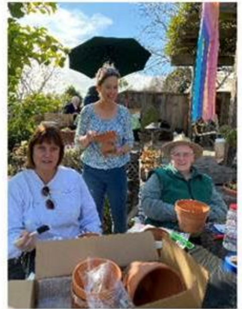
Dirt Divas preparing for Plant Sale