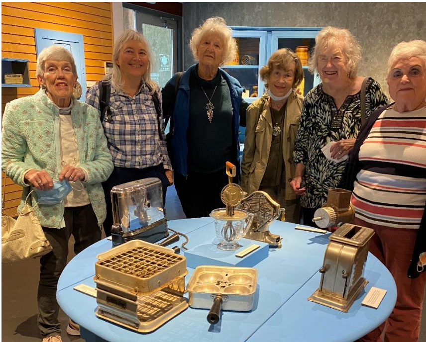
Museum Group at the Napa Valley Museum