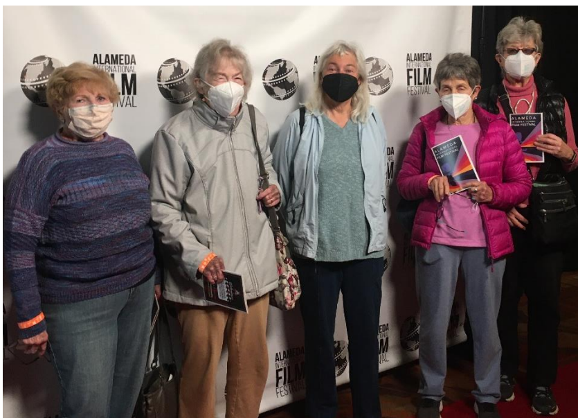
Cinema Club at the Alameda Film Festival