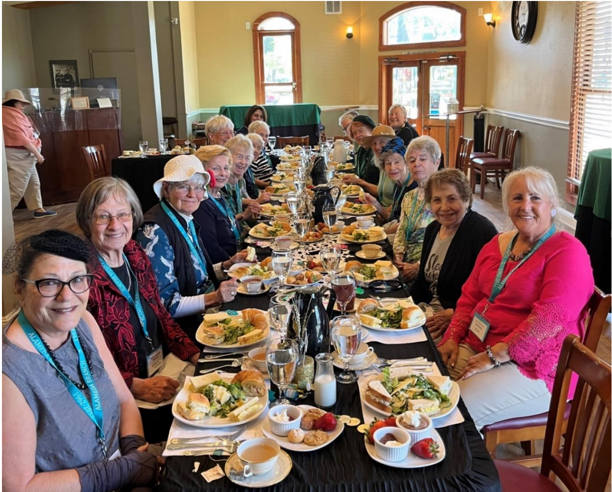
AAUW Alameda April Tea/Luncheon at High Street Station