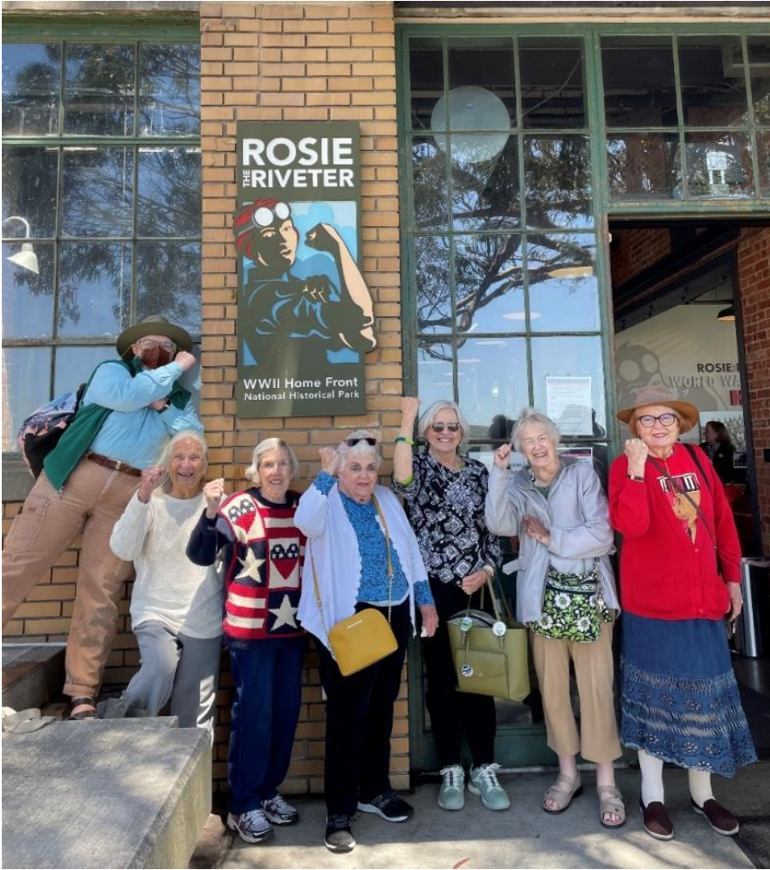
Museum Group at Rosie the Riveter Museum