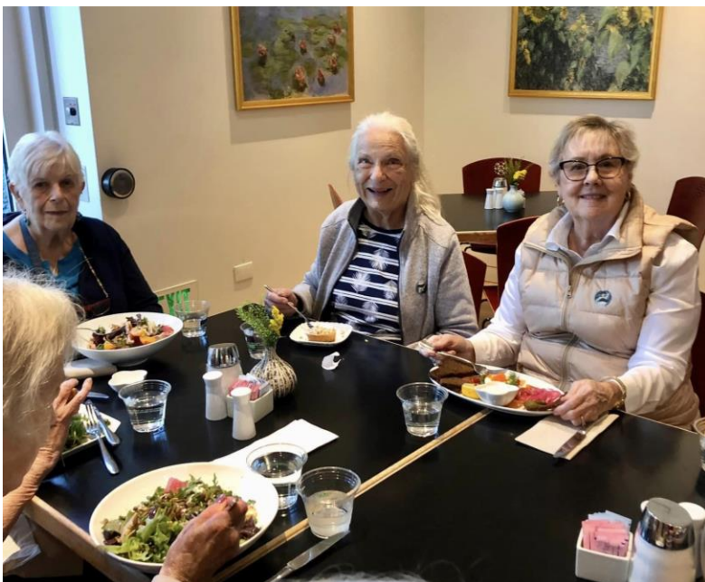
Museum Group at Mary Cassatt Exhibit at the Legion of Honor Museum