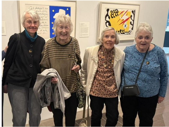
The Museum Group visits De Young museum where they saw the early Beatles photos and Matisse's Jazz art