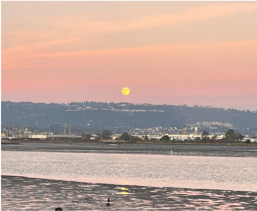
December Moonrise in Alameda